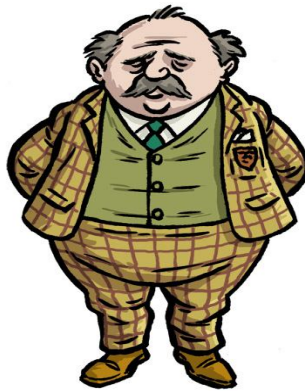
A _____ man