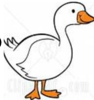
A _____ duck