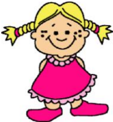
A _____ girl