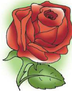
A _____ rose