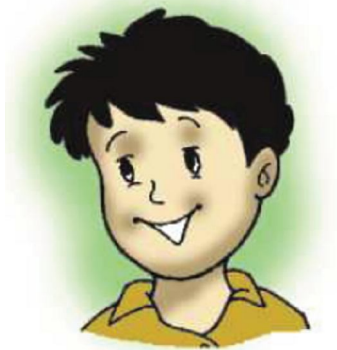
A _____ boy