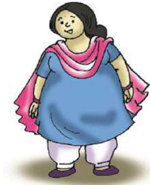
A _____ woman